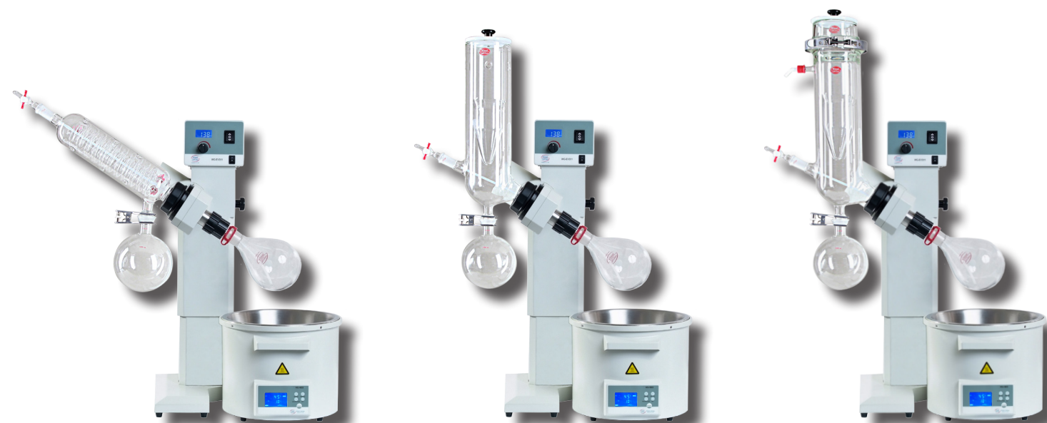
WG-EV311-D-PLUS (diagonal condenser model) from $2186

Please visit www.wilmad-labglass.com for a complete list of glassware configurations.