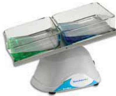
B3D1008 Mini BlotBoy with 10.5" x 7.5" Flat Mat $355