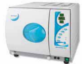
B4000-16 BioClave 16 Digital Benchtop Autoclave $3895