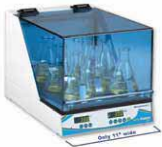
H1000-M Mini Shaking Incubator $2395