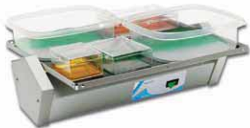
BR1000 BenchBlotter Platform Rocker $377