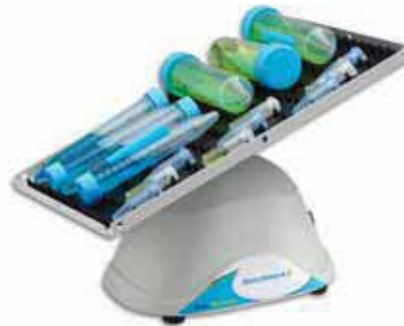
B3D1020 MiniMixer with 10.5" x 7.5" Dimpled Mat $355