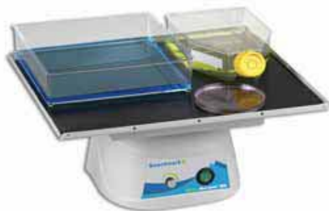
BR2000 BenchRocker 2D Variable Speed Rocker $595