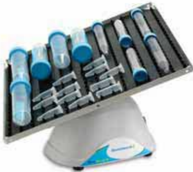
B3D1320 BioMixer with 12" x 12" Dimpled Mat $377