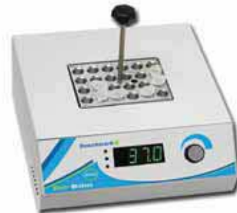
BSH1001 Dry Bath Single Position $359

Please visit www.wilmad-labglass.com for additional blocks.