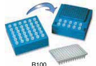
R100 MicroTube and PCR Plate Cooler $99

Please visit www.wilmad-labglass.com for all 5 lid colors.