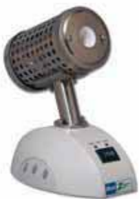
B1000 BactiZapper MicroSterilizer $279