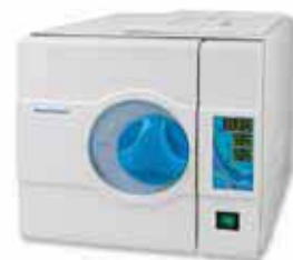
B4000-M BioClave Mini Digital Benchtop Autoclave $2995