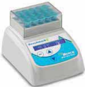
BSH100 MyBlock Mlni Digital Dry Bath $199.95