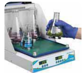
H1000-MR (shown) or BT3000-MR (14x12" for Orbi-Shaker). Universal platforms use magnetic clamps (50mL to 2L) for easy configurations. Visit www.wilmad-labglass.com for more info