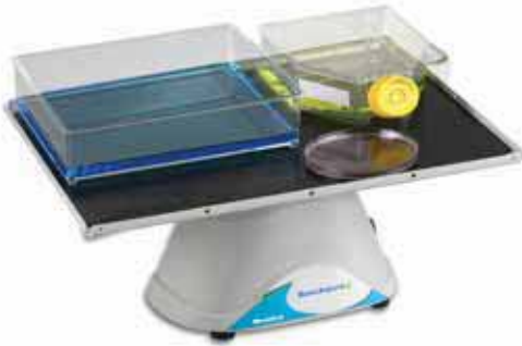
B3D1308 BlotBoy with 12" x 12" Flat Mat $377