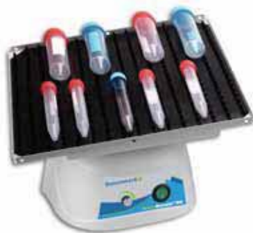
B3D2300 BenchRocker 3D Variable Speed Rocker $595