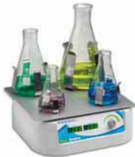
BT300 Orbi-Shaker JR $845