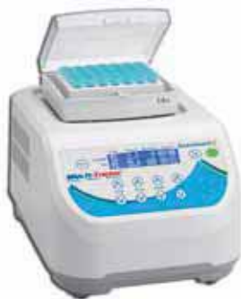
H5000-HC Multi-Therm Shaker w/Heating and Cooling $2395