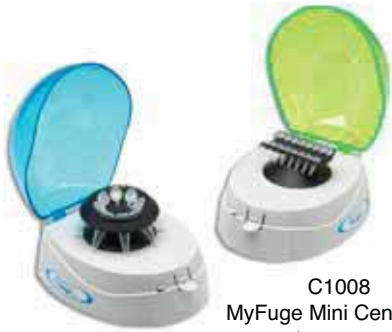
C1008 MyFuge Mini Centrifuge $259.50